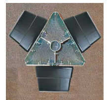
Top view of 7002-01 shown with three 7200-01 dispensers