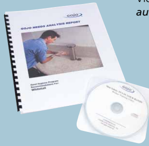
GOJO Needs Analysis Report and Manufacturing Training Program CD

Learn about a skin care program evaluation in the oil production and refinery industries.