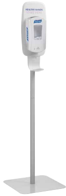
2424-DS shown with 1920-04

Options to make hand hygiene more accessible.