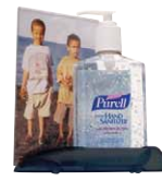
PURELL Desk Caddy