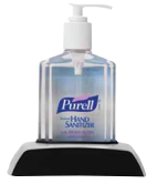
PURELL CLASSIC HOLDER™